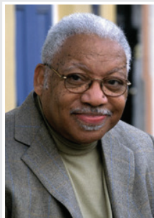
Ellis Marsalis NEA Jazz Master & Artistic Director